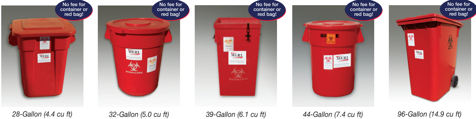
28-Gallon (4.4 cu ft)